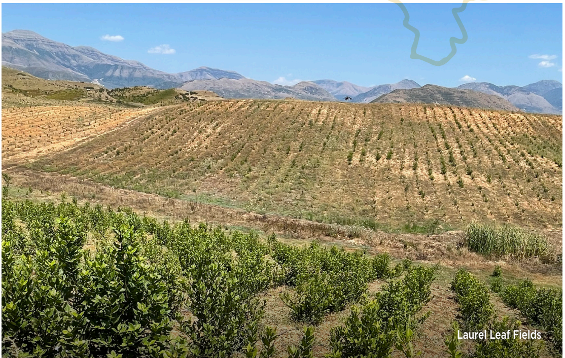
Laurel Leaf Fields