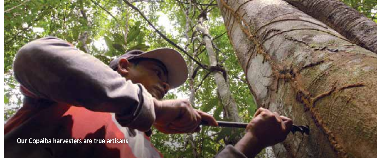
Our Copaiba harvesters are true artisans