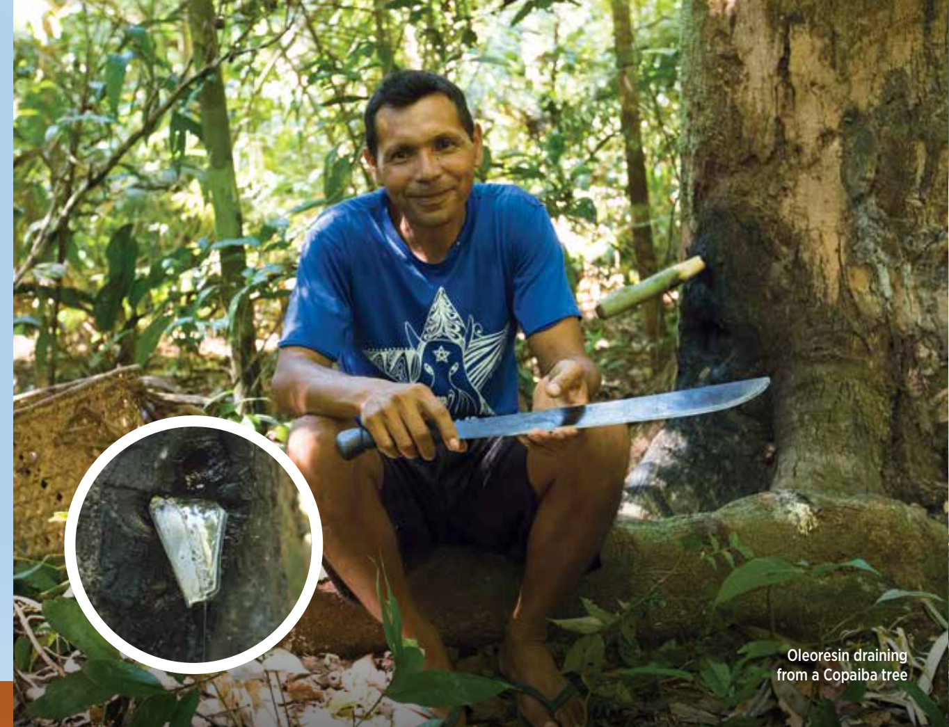
Oleoresin draining from a Copaiba tree

Clean Water: Although water is very abundant throughout the Amazon, access to potable water is a very different and immediate concern. We will be implementing water purification initiatives that are sustainable and affordable for these smaller communities. This will further support our envisioned healthcare initiatives.