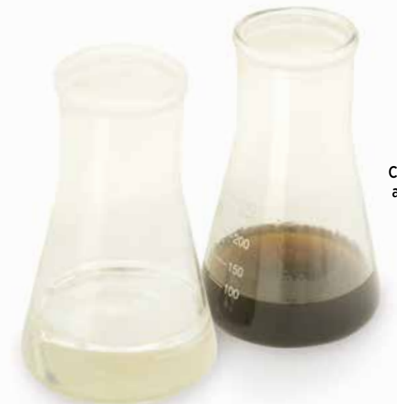
Copaiba Oleoresin as harvested from the trees