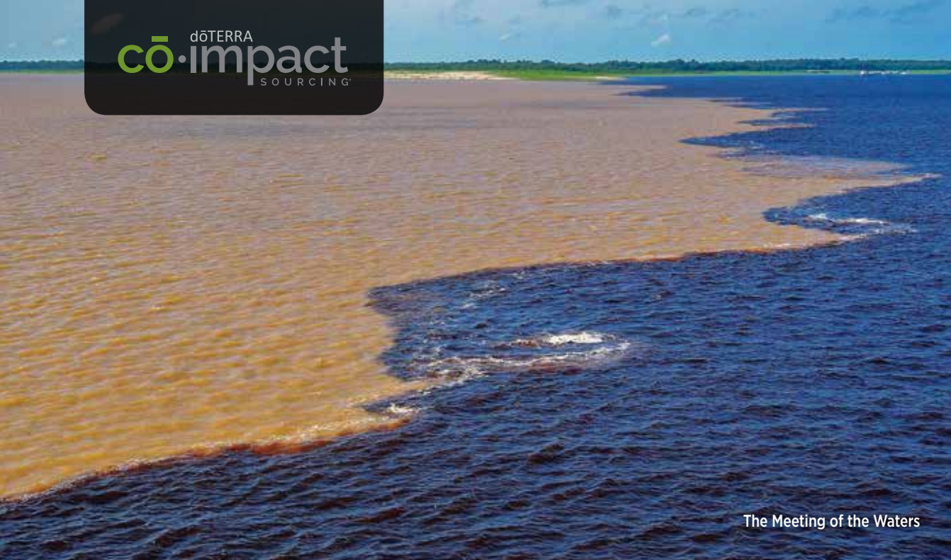
The Meeting of the Waters