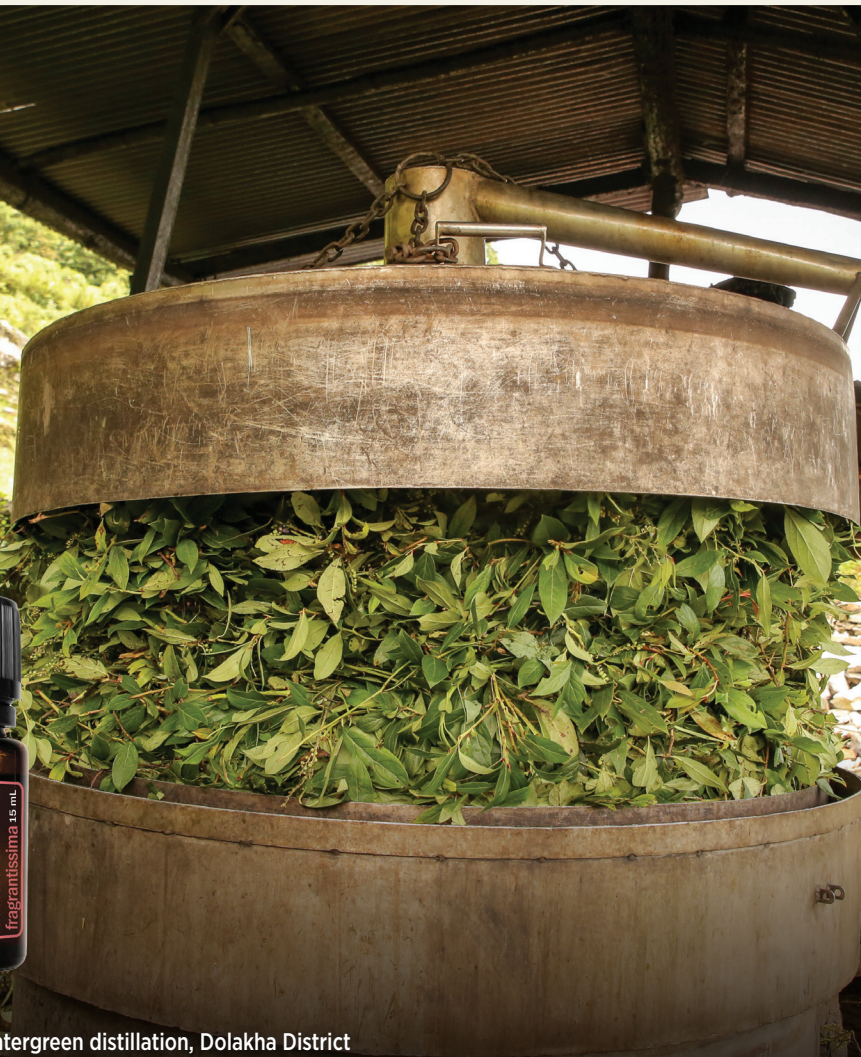
Typical Wintergreen distillation, Dolakha District