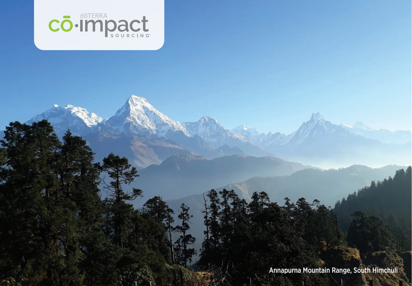
Annapurna Mountain Range, South Himchuli