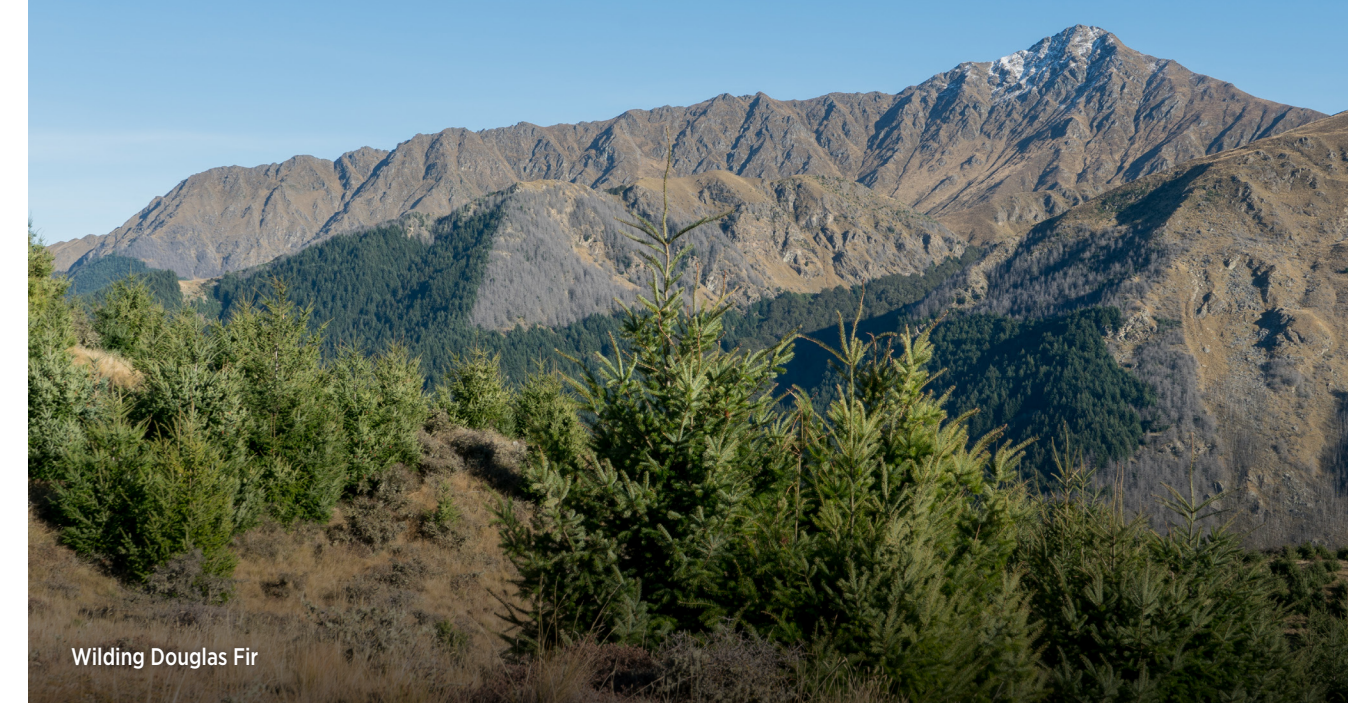
Wilding Douglas Fir