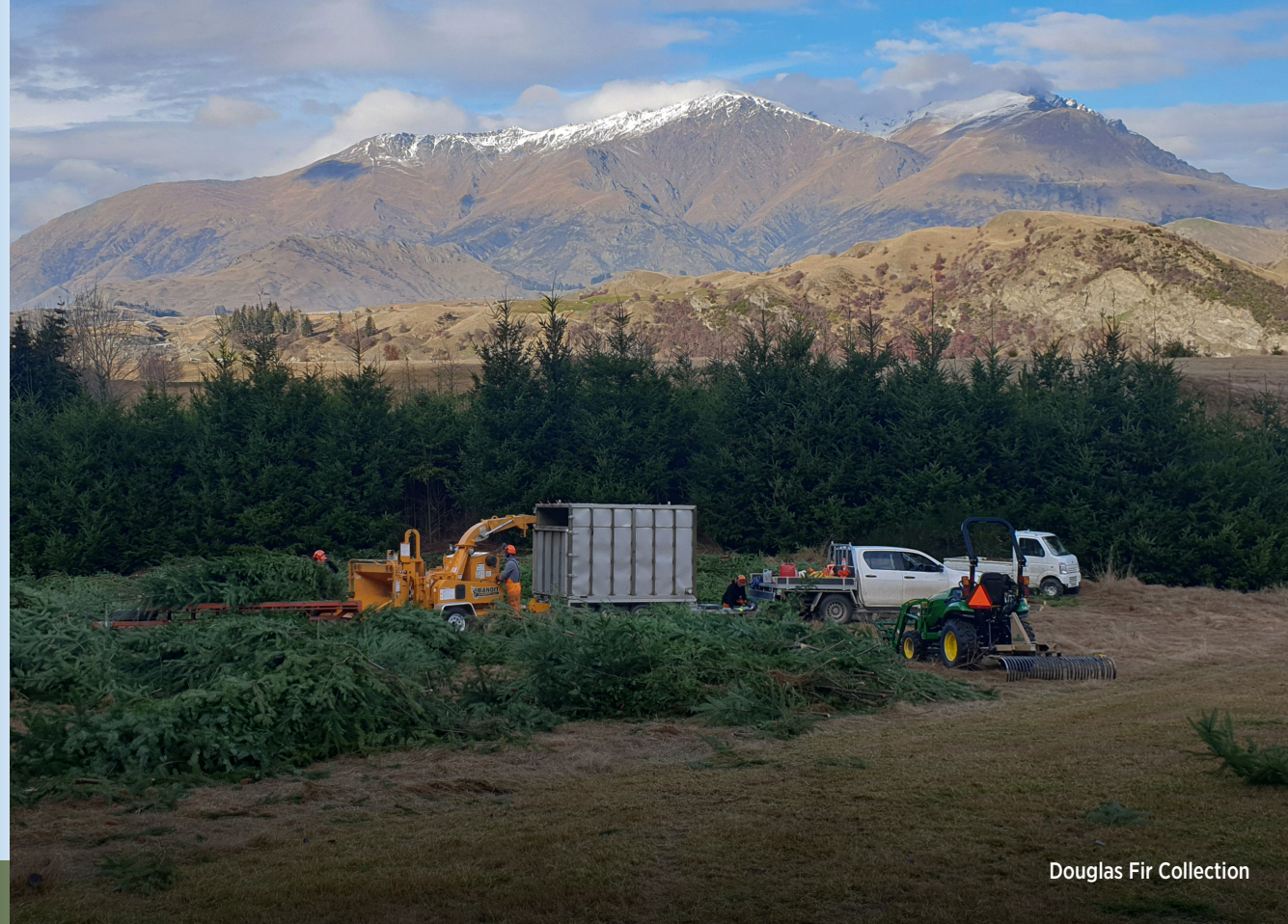
Douglas Fir Collection

“Wilding” Douglas Fir is the New Zealand term to describe trees that have grown as a result of the propagation of seeds that have spread across the landscape of New Zealand on their own, becoming invasive