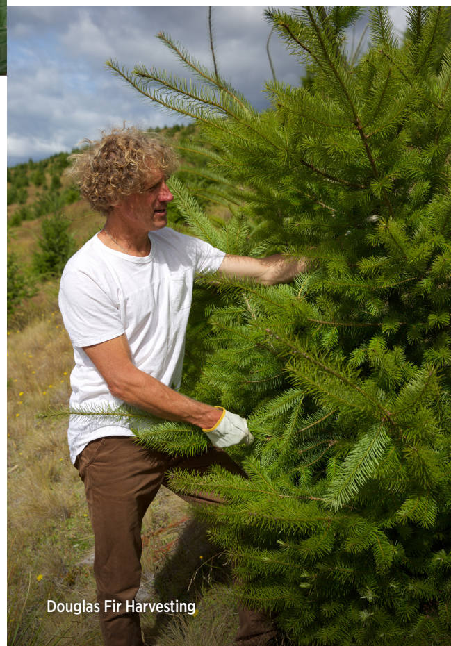
Douglas Fir Harvesting

New Zealand is also known for its unique birds and vegetation. New Zealand separated from the continent of Gondwana before the evolution of mammals, so there are actually no native mammals. Because of the high rainfall, much of New Zealand is lush and green, with more than 1,500 species of trees and plants, many not seen anywhere else on earth. Under the native trees, a dense undergrowth of shrubs, ferns, mosses, and lichen generally grow. It is a beautiful country rich in biodiversity and one with a very fragile ecosystem.