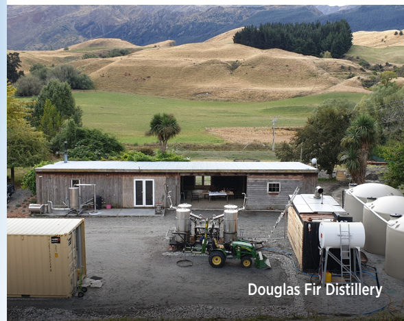
Douglas Fir Distillery